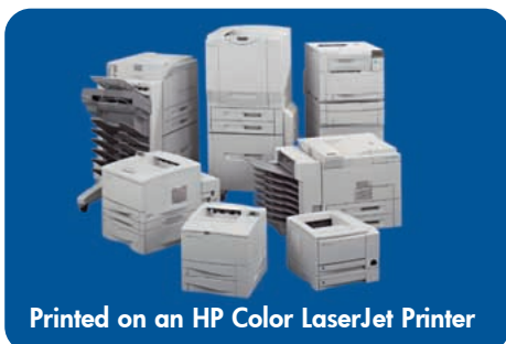
Printed on an HP Color LaserJet Printer